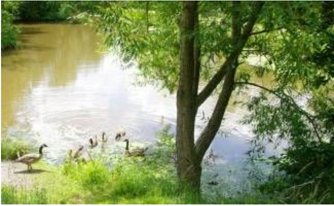
One of the many lakes